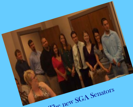
The new SGA Senators