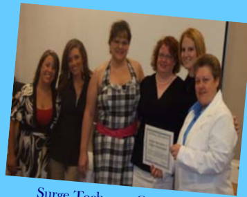
Surge Tech won Outstanding Organization Award