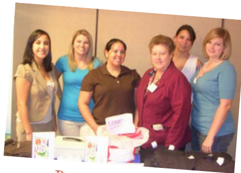
The group selling t-shirts